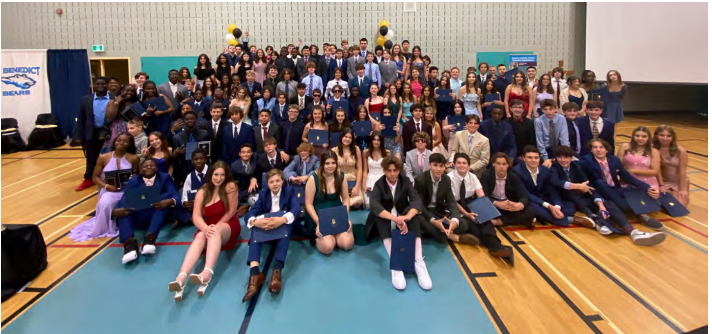
Ursa House on a House Day celebrating another victory

“...it’s important to set goals for myself.”